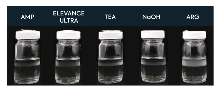
ELEVANCE ULTRA shows great propellant compatibility, superior resin solubility and clarity in aerosols